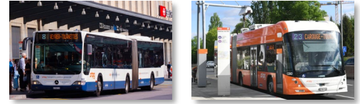
TPG vehicles are either blue or orange in Geneva