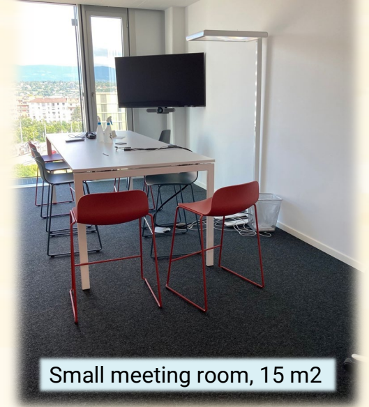
Small meeting room, 15 m 2