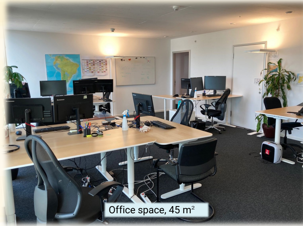
Office space, 45 m 2