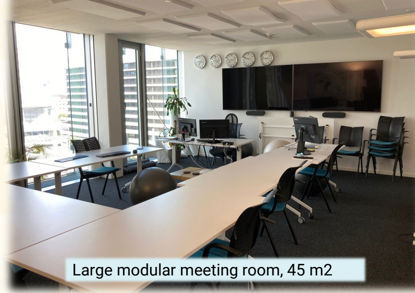
Large modular meeting room, 45 m 2

Please contact: Caroline Draveny cd@acaps.org +41 79 763 05 66